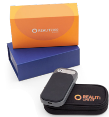
CPR Module 1022856