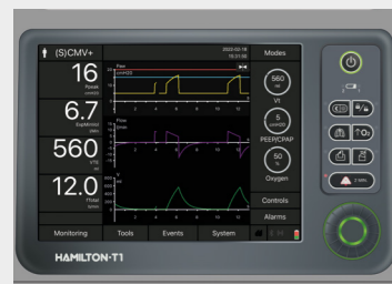
Hamilton T1 Ventilator 8001137