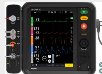
LIFEPAK 35 Defibrillator 8001275